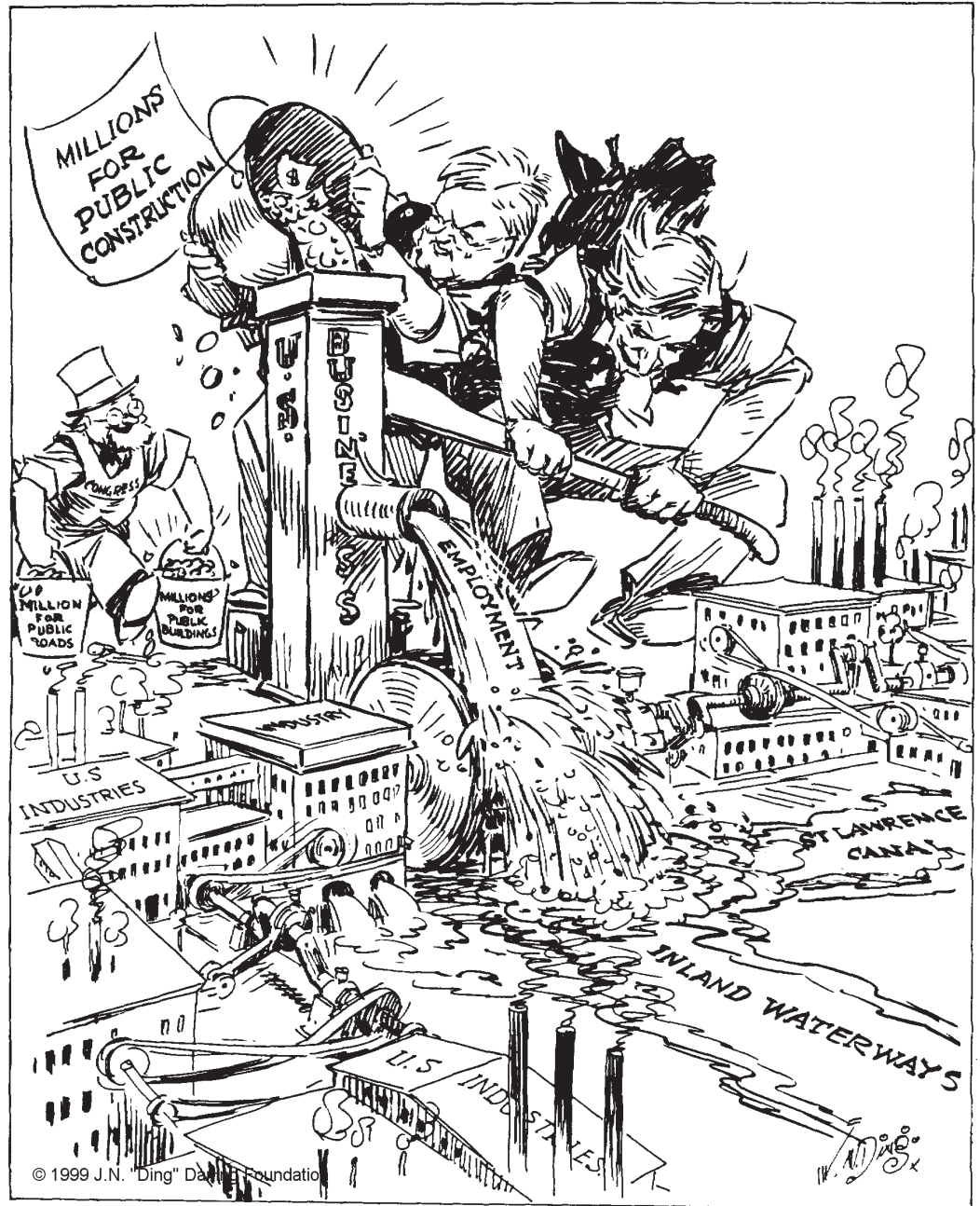
Figure 2 Reproduction of a New York Tribune Editorial Cartoon from April 8, 1930