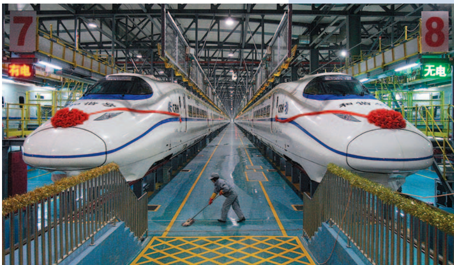
China Railway High-speed trains are prepared for the opening ceremony of a new line from Wuhan to Guangzhou.