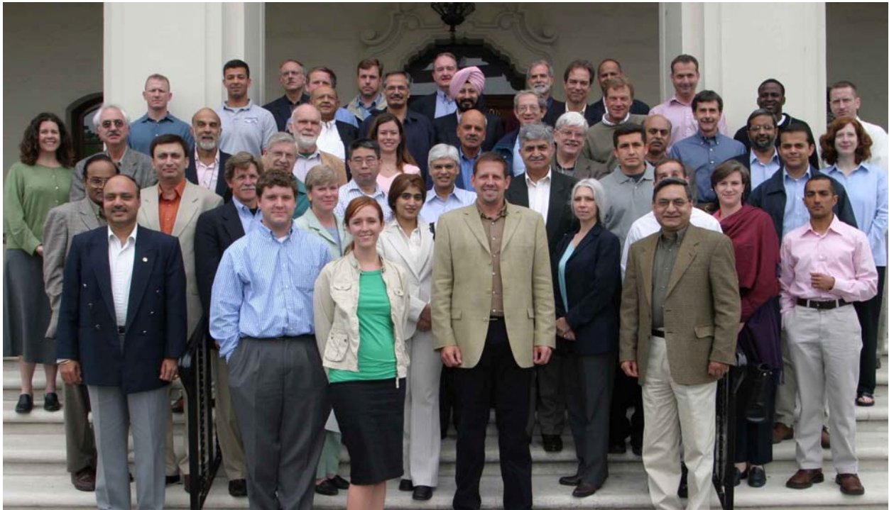
Monterey Conference Participants