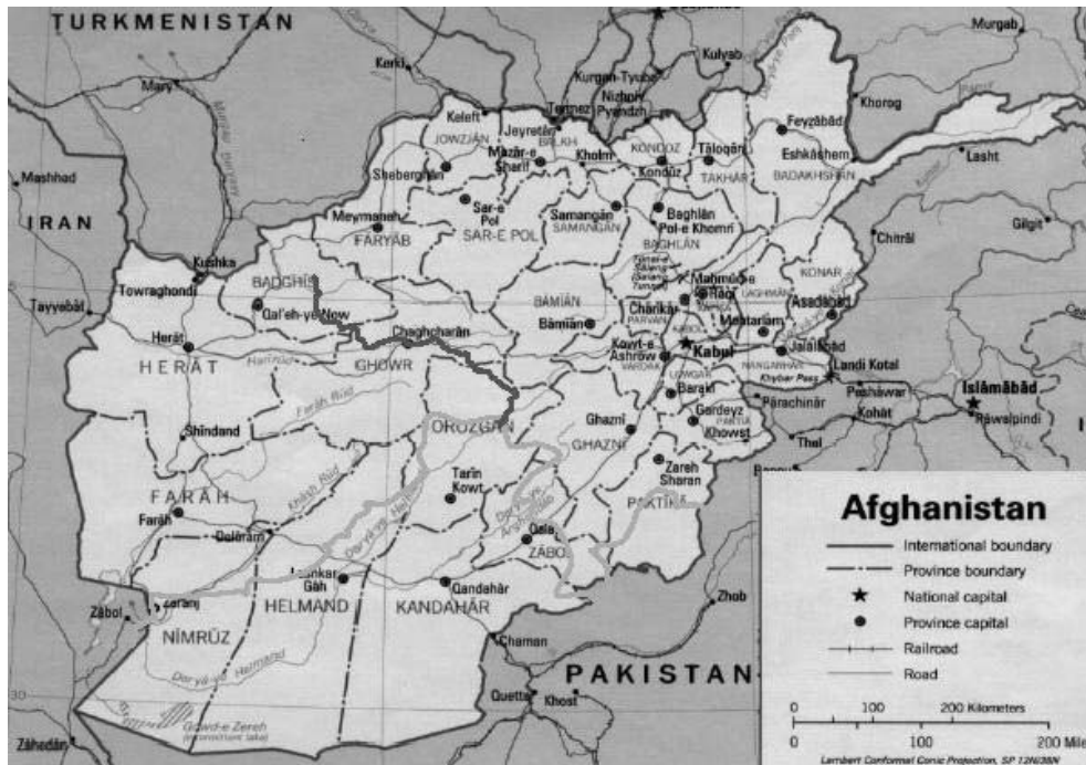
Map of Afghanistan