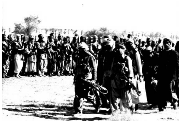
Ismail Khan assessing troops during the anti-Soviet jihad.

During this time Iran also sent large stocks of weapons to Herat and Khan, which culminated in the United States firing a cruise missile at Khan's Headquarters, killing eighteen of his men in January 2002[12]. The Bush Administration is obviously extremely concerned about Iranian influence in Afghanistan.