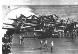
U.S. forces as they prepared to ambush the Japanese in Hawaiian waters

The Battle of Midway, fought between 4 and 7 June 1942, marked the turning point of the Pacific War. Until Midway, the Japanese navy, building on the 7 December 1941 surprise attack against the U.S. fleet at Pearl Harbor, held the strategic initiative. The Philippines, Singapore, Burma and the Dutch East Indies fell to the seemingly unstoppable Japanese juggernaut. After Midway, the Japanese march to victory turned to defeat. Midway so reduced Japanese carrier strength that henceforth the Rising Sun was condemned to react to the relentless American advance across the Pacific toward Japan's home islands.