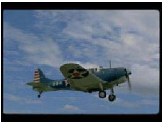
Dauntless Dive Bomber