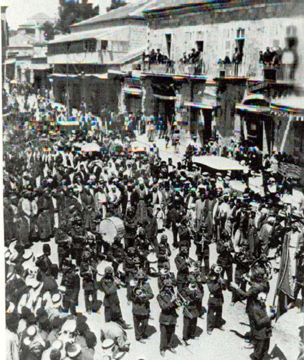
Palestinians demonstrate against Jewish immigration, 1930

The Mufti also benefited from the downturn in Britain's international fortunes. From 1938, Germany, Italy and even Spain stoked the glowing embers of Arab nationalism with radio broadcasts, "cultural" subsidies and anti-Semitic articles that the Mufti translated and distributed through Muslim schools. Palestinian Arabs imitated fascist political organizations and praised German racial laws, failing to appreciate that Hitler was Zionism's best recruiting sergeant, one who actually exacerbated their problems. Rather, they dreamed of the day when Italy and Germany would eject Britain, and with them the Jews, from the Middle East. By the outbreak of war in 1940, Palestine boiled with rebellion —20,000 British soldiers struggled to keep order between Muslim extremists who turned much of Jerusalem into a no-go area, and Jewish militants like Moshe Dayan whose Haganah ("Defense"), organized and trained by the pro-Zionist Scots Captain Orde Wingate, led reprisal raids against the Mufti's supporters as far away as Syria and Lebanon. [2]