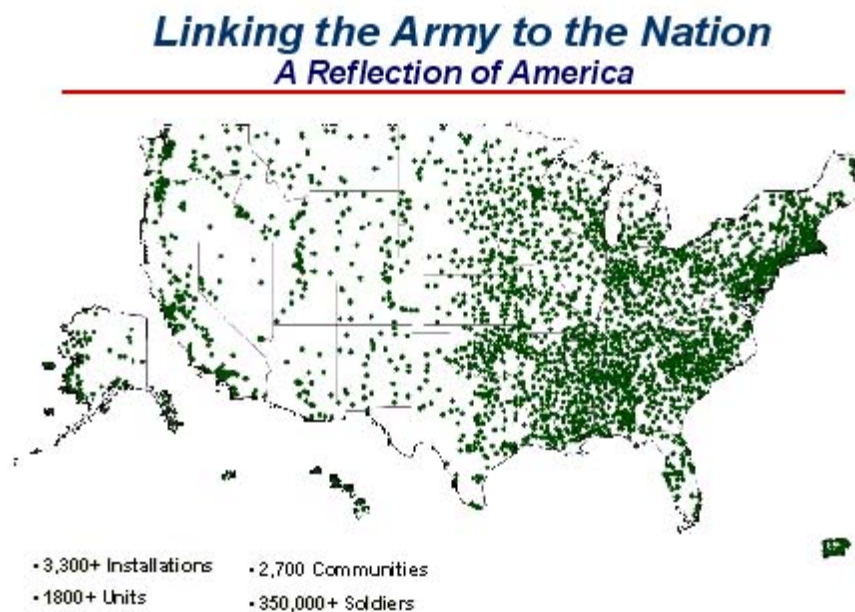
FIGURE 2-THE NATIONAL GUARD IN US COMMUNITIES (USED WITH PERMISSION)