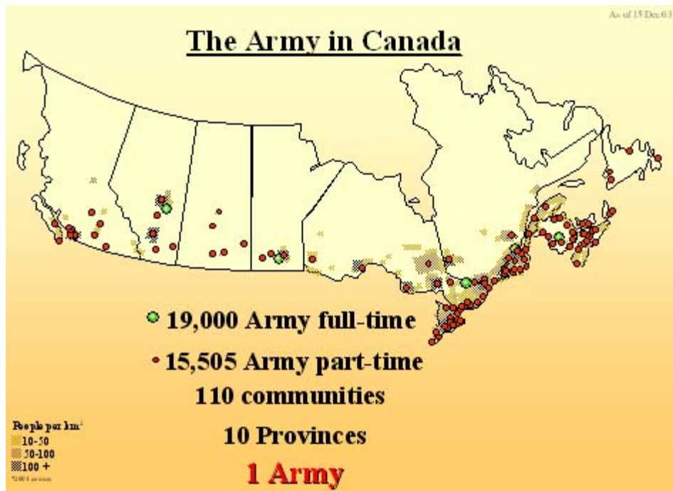
FIGURE 1-THE ARMY IN CANADA (USED WITH PERMISSION)