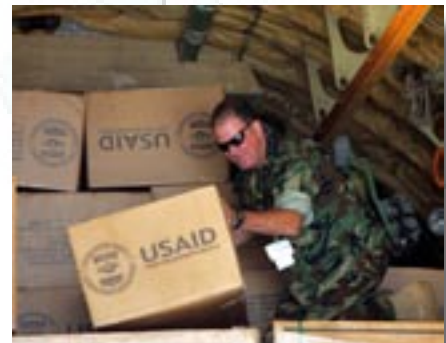
A U.S. Navy soldier unloads a box of relief goods at Manila's international airport in December 2006. The goods were donated in response to the humanitarian needs following Typhoon Dorian.