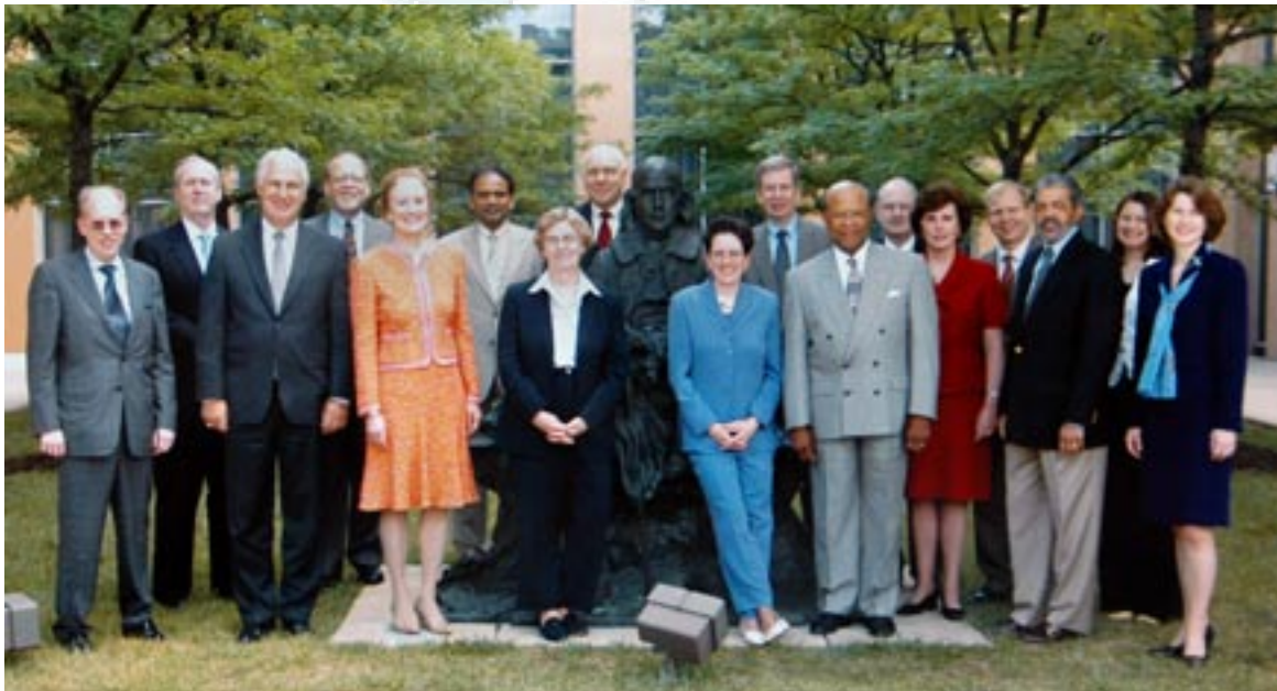
U.S. Department of State