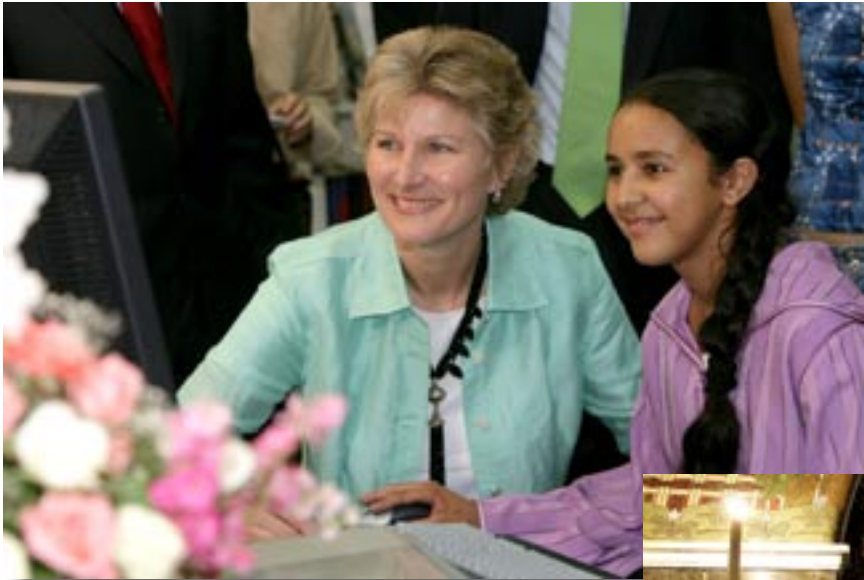
U.S. Under Secretary of State for Public Diplomacy and Public Affairs Karen Hughes shows a young Moroccan girl an Internet site during a ceremony to open Morocco's second American Corner in June 2006.