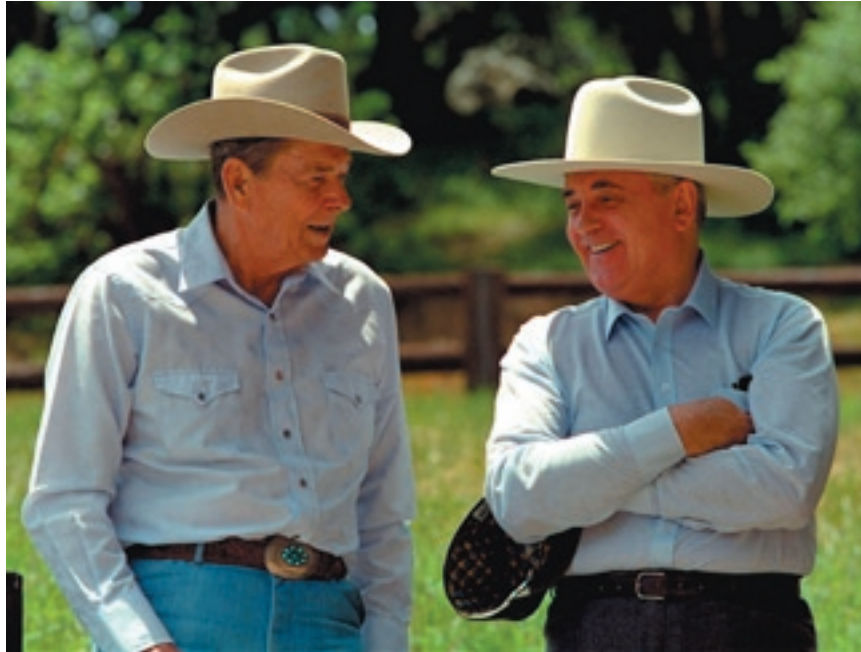
Former U.S. President Ronald Reagan, left, and former Soviet President Mikhail Gorbachev show off their cowboy hats during a quiet moment together, May 2, 1992, on Reagan's Rancho del Cielo, a 688 acre spread in the mountains 30 miles north of Santa Barbara, California.

“History shows that terrorism can operate only in free, or relatively free, societies. There was no terrorism in Nazi Germany or in Stalin’s Russia; there was (or is) none even in less harsh dictatorships. But this means that in certain circumstances, if terrorism has been permitted to operate too freely and become more than a nuisance, a high price has to be paid in terms of limitation of freedom and human rights to put an end to it.”