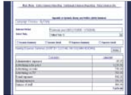
IFES MAP Model Database allows users to examine political finance information from many different angles.

Disclosure of financial accounts is a key component of an effective political finance regime. Tracking the money allows voters to make better-informed decisions, thereby strengthening the election system as a whole. To be effective, information about political finance must be made available to political and oversight groups, the media and ultimately, the electorate.