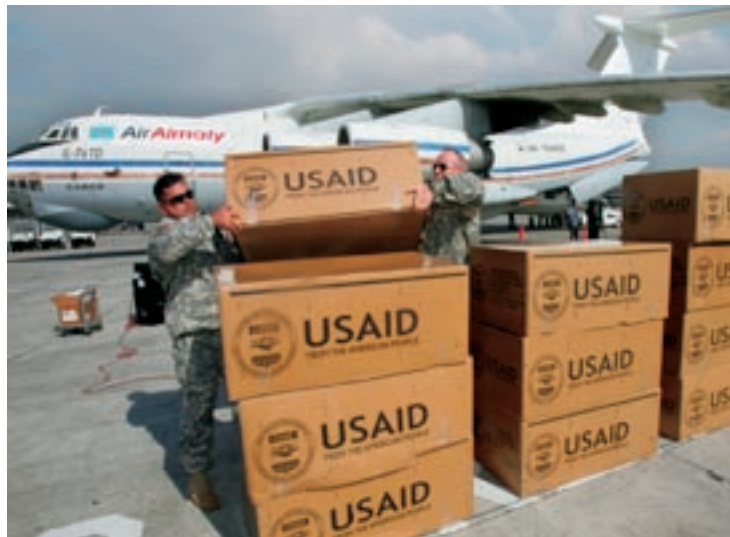
Congress is deciding whether U.S. food aid will consist entirely of U.S.-produced commodities or whether some part of the food could be purchased from foreign producers closer to a site of emergency.

The final outcome remains uncertain, however. To become law, a final version of the 2007 farm bill must be passed by both the House and Senate and signed