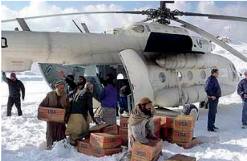
The United Nations World Food Program works quickly delivering food in emergencies such as the 2005 earthquake in Pakistan.