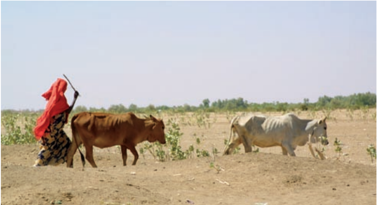
USAID is working to help African herdsman, such as this woman driving cattle near Zeway, Ethiopia, to sustain their livelihood.

In Ethiopia, an innovative collaboration between a U.S. government foreign aid agency and nongovernmental organizations has allowed herdsman not only to survive drought but also to rebuild their lives.