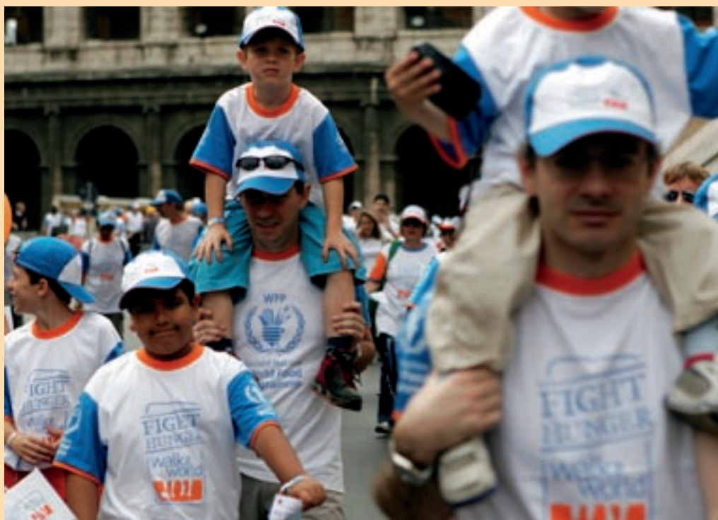
Participants in the World Food Program's "Walk the World" global march against hunger in Rome in 2005. Proceeds raised by the annual event go to the WFP's Global School Feeding Program, which provides free school meals to millions of children in developing countries.

The WFP, which is based in Rome, distributes food assistance to nearly 88 million people, with about one-third of that going to development projects and the remaining two-thirds going to emergencies and relief and recovery operations. The WFP works with multilateral and bilateral groups, individual countries, corporations, and foundations to collect and distribute food and other commodities.