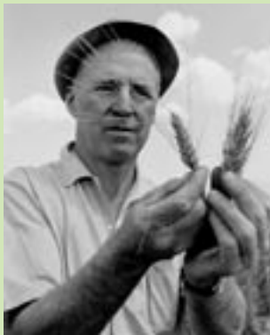
Norman Borlaug in 1970.