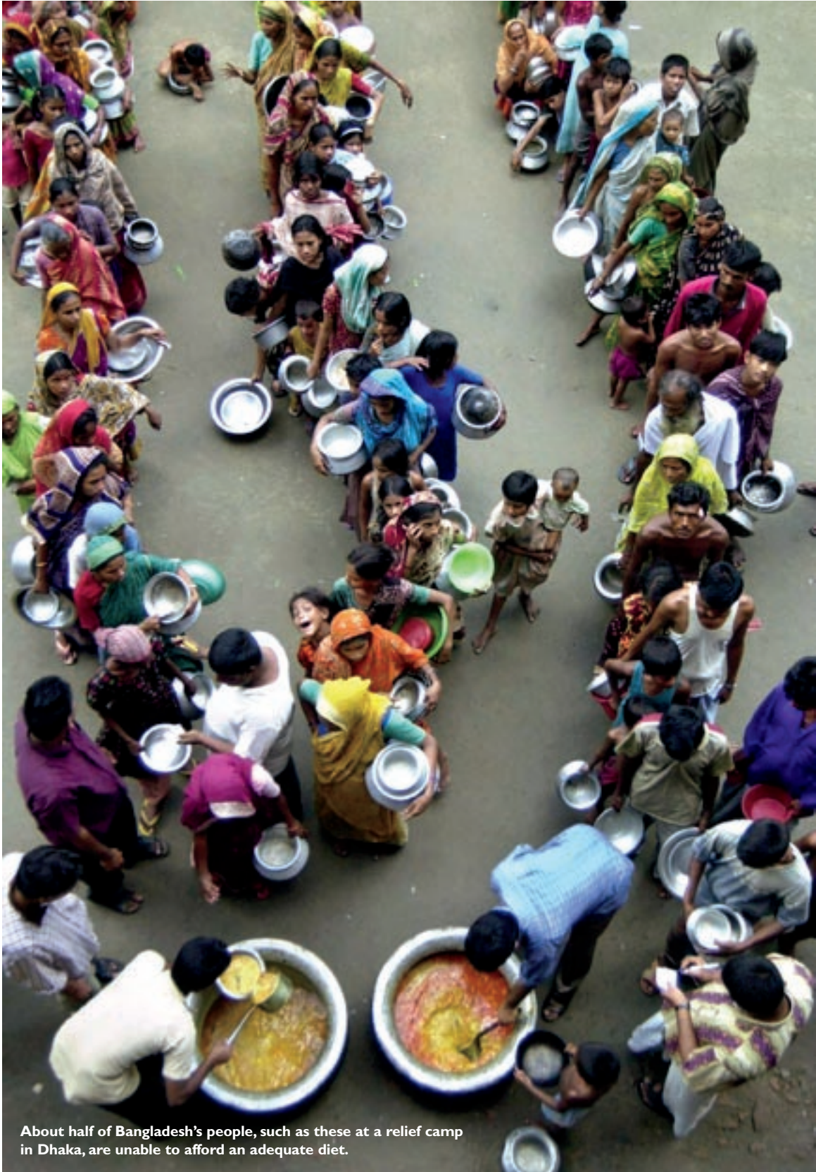
About half of Bangladesh's people, such as these at a relief camp in Dhaka, are unable to afford an adequate diet.