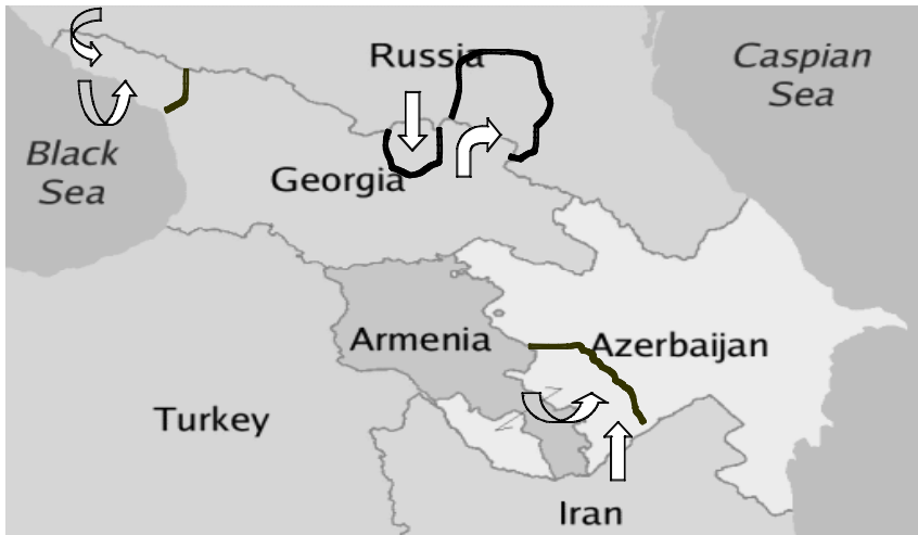
Figure 4: Weapons trafficking routes in the Caucasus

particularly engaged in weapons smuggling (among other activities) within their operation areas, which include Mingrelia, the Gali district, and the Kodori Gorge in western Georgia. Similar phenomena take place in Chechnya and Dagestan, where local terrorist and insurgent groups purchase weapons from Russian sources and disperse them to the population for operational or commercial purposes. At the same time, some high-end weapons, like man-portable air defense systems (MANPADS), are smuggled into Chechnya and Dagestan from abroad. In the summer of 2002, Chechen insurgents managed to smuggle several dozen MANPADS across the Georgian-Russian border to Chechnya. The Chechen insurgents subsequently shot down several Russian helicopters, resulting in the loss of a high number of personnel and posing serious implications for operations, which lasted until the end of the year. 25