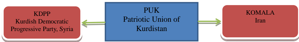
Figure II: PUK-Affiliated Parties

works for the implementation of the Universal Declaration of Human Rights" "it favors a free-market economy." 23 Like the KDP, the PUK has the representatives in Europe. It also and has good relations with the West and with Iran. The party's affiliated business elite run a major television station, Kurdsat, as well as daily newspapers, radios, and monthly magazines. Before its dissolution, the PUK was the balancing power against the KDP. Now, however, many believe it has lost about a third of its supporters to the Gorran Movement led by Nashirwan Mustafa. The Kurdish Democratic Progressive Party (KDPP) in Syria, which is one of the oldest Kurdish movements in the Kurdish region, is the PUK's sister party. In addition, the Komala Party in Iranian Kurdistan has strong ties with the PUK, finding sanctuary and operating in the PUK-dominated areas.