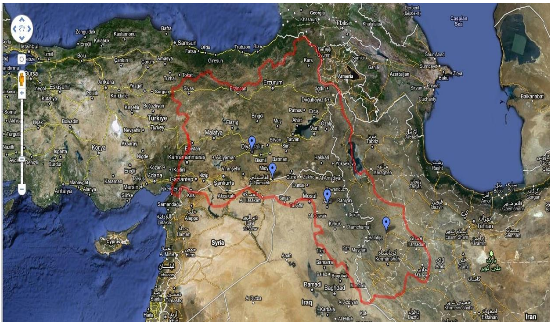
Map of Kurdistan according to Google

Kurdistan is divided, and the Kurdish people are not united geographically. They are split among numerous political parties and institutions in several different countries. Various early attempts to build Kurdish national movements after 1918 failed. Modern Kurdish parties began to emerge after World War II. In the post-Cold War era, Kurdish movements have gained momentum politically, economically, socially, as well as at the regional and international levels. The current period may well be a particularly crucial one for Kurdish aspirations. This article offers an overview of Kurdish political parties and references the most significant literature and resources available on them.