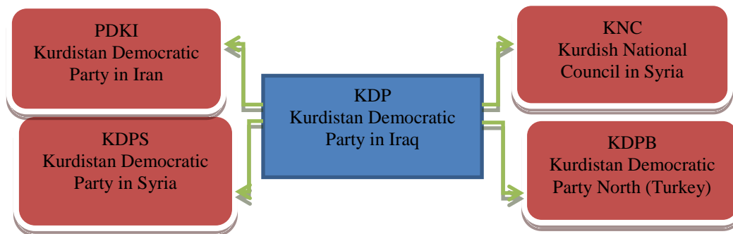
Figure I: KDP-Affiliated Parties in Kurdistan

intelligence service, Parastin. The Barzani family and the KDP wield influence not only in Iraqi Kurdistan but also in Iranian Kurdistan. They provide sanctuary in the KRG area of northern Iraq for their Iranian sister party, the Democratic Party of Iranian Kurdistan. Among the Turkish Kurds, their influence is weaker. The Kurdistan Democratic Party of Bakur (north) is not a major player. The Syrian affiliate, the Kurdish Democratic Party in Syria is similarly uninfluential. The Kurdistan Democratic Party has representatives in Turkey, in nearly every European country, and in North America. It also maintains good relations with Israel. The KDP runs several television stations as well, including major ones such as Kurdistan TV, Zagros TV, and Rudaw.