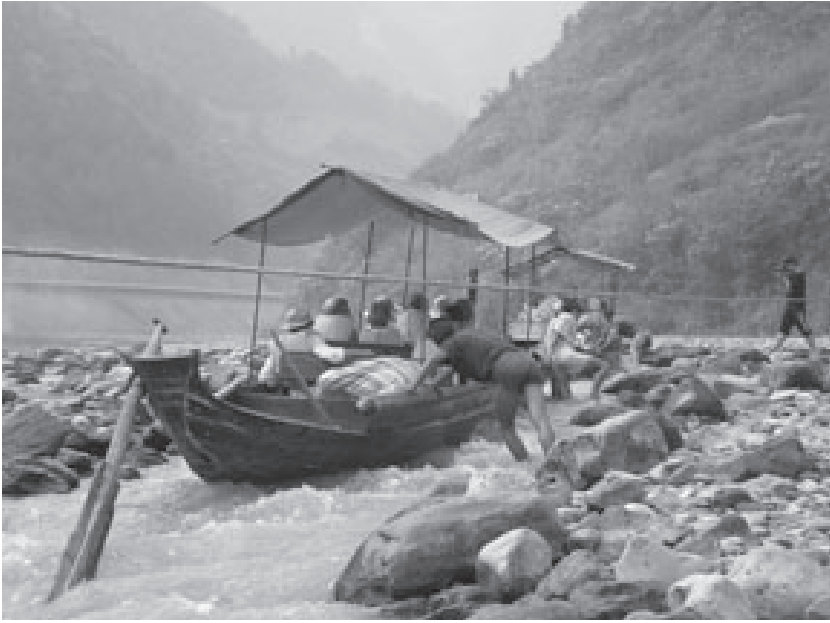
Illustration 1. Going Upstream on the Shennongxi.

scendental, and transformative agent of Chinese actions and imaginations that is simultaneously a force and a result of the process. 7 It is with references to this self that Chinese people claim musics of contrasting and conflicting forms and contents as their own, generating a dynamic music culture that revealingly and simultaneously operates with a multitude of indigenous and adopted musical theories, practices, and repertoires, each of which embodies individualized temporalities, sites, memories, and imaginations.