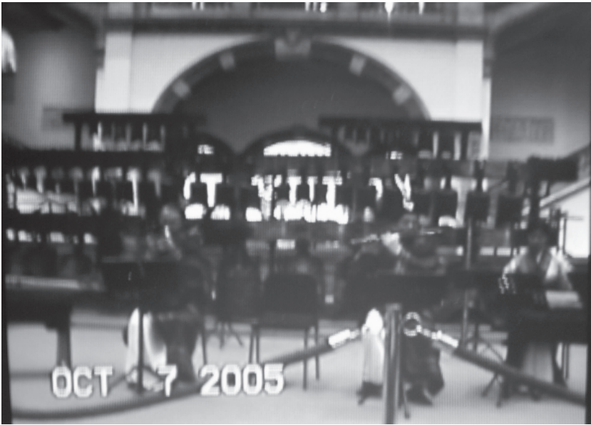
Illustration 9. A Performance of Bell-Chime Music at the Tropical Museum, Amsterdam.

Chinese operatic stages. The deep sounds of the big bells echoed in the large and domed hall, generating sonic confrontations between ancient and modern Chinese pitches, and between Chinese musical instruments and European edifice.