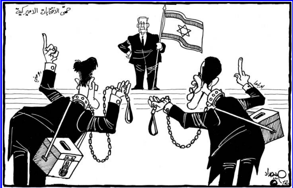
Presidential elections in the United States: Obama and Romney pander to Israeli PM Bibi Netanyahu. (2 August 2012)