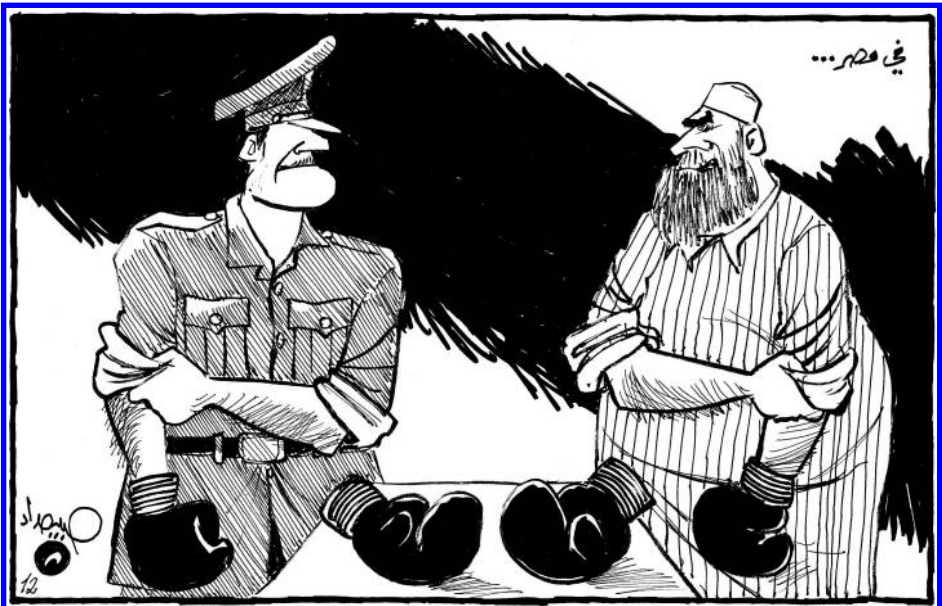
The stand-off between the Islamists and the military in Egypt. (12 July 2012)

Journal of Palestine Studies Vol. XLII, No. 1 (Autumn 2012), pp. 97–98, ISSN: 0377-919X; electronic ISSN: 1533-8614. © 2012 by the Institute for Palestine Studies. All rights reserved. Please direct all requests for permission to photocopy or reproduce article content through the University of California Press's Rights and Permissions website, at http://www.ucpressjournals.com/reprintInfo.asp . DOI: jps.2012.XLII.1.97.