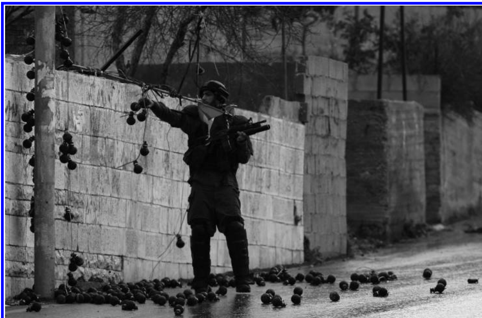
An Israeli soldier dismantles a display of empty tear-gas canisters collected by a Palestinian family outside their home during a weekly demonstration against the Israeli occupation in the West Bank village of Nabi Salih, 24 February 2012.