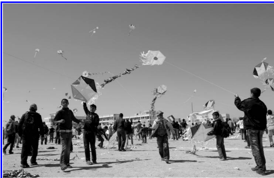
Palestinian children fly kites bearing Palestinian and Japanese flags near a Japanese-funded reconstruction project in Khan Yunis in a show of solidarity with the victims of the March 2011 earthquake and tsunami that ravaged Japan, 18 March 2012.