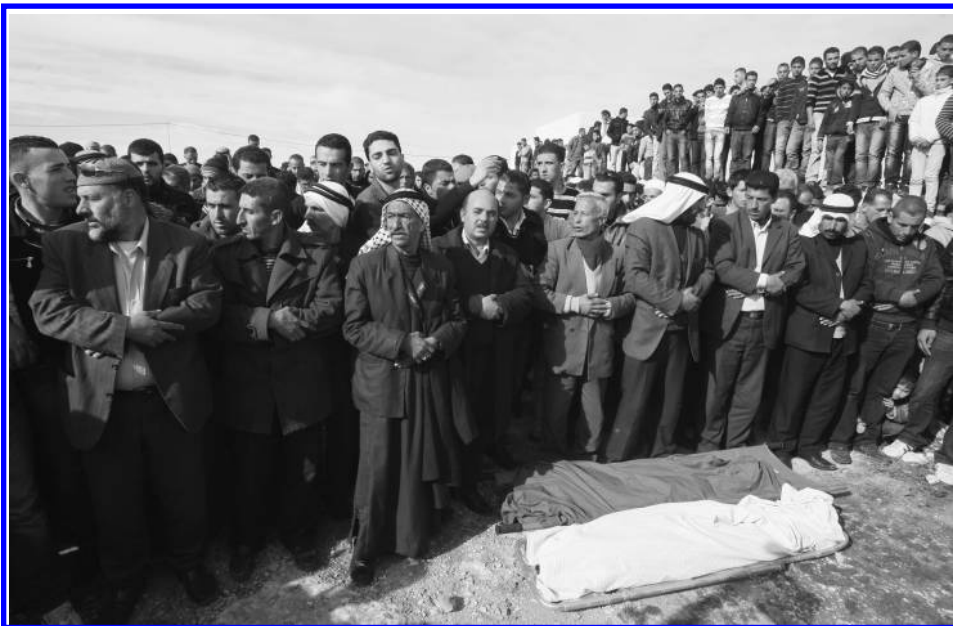
Palestinian mourners attend the funeral of two Palestinian boys who were killed when they accidentally triggered unexploded Israeli ordinance outside the West Bank city of Wadi al-Rim (near Hebron), 7 March 2012.