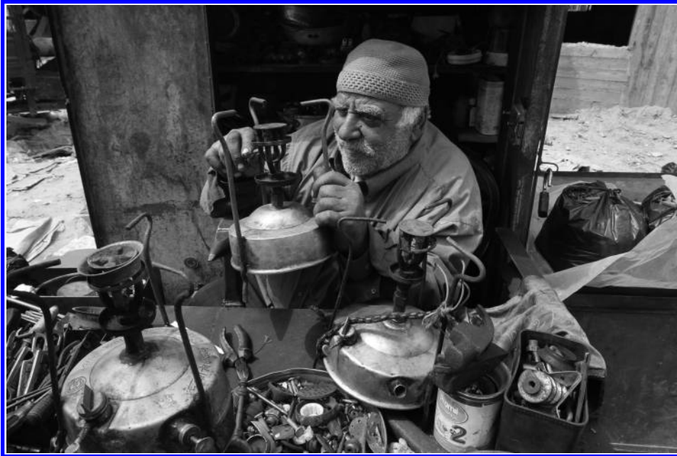
An elderly Palestinian man repairs kerosene stoves in Gaza City during an extended electricity shortage caused by Israeli restrictions on fuel imports to Gaza, 20 March 2012.