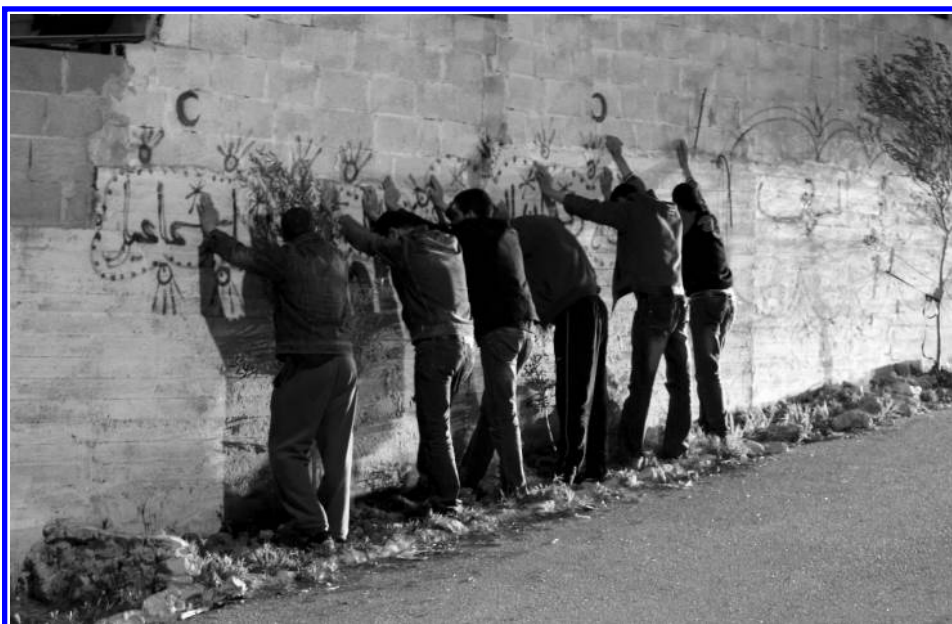
Palestinians arrested by Israeli soldiers are forced to stand facing a wall following clashes in Hebron that erupted between Palestinians and Jewish settlers sparked when settlers severely beat a Palestinian man outside his home, 17 April 2012.