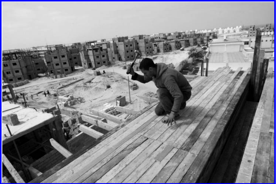
A Palestinian laborer works at a UNRWA-funded construction site to rebuild a residential area of Rafah destroyed by Israel during its 2008–9 Operation Cast Lead assault on Gaza, 21 March 2012.