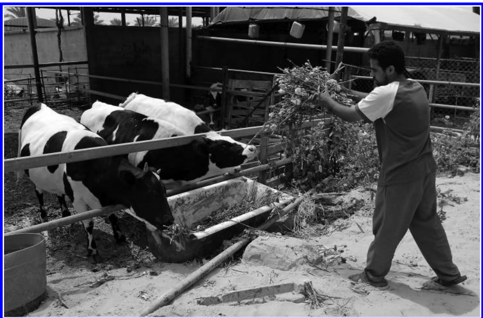
A Palestinian farmer in Rafah feeds his cows wilted carnations that normally would have been sold abroad if it were not for Israeli export restrictions imposed on Gaza, 29 April 2012.