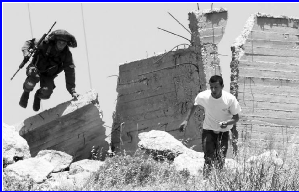
An Israeli soldier chases a Palestinian who threw stones during a protest held in al-Khadir village (near Bethlehem) in solidarity with hunger-striking Palestinian prisoners being held in Israeli jails, 10 May 2012.