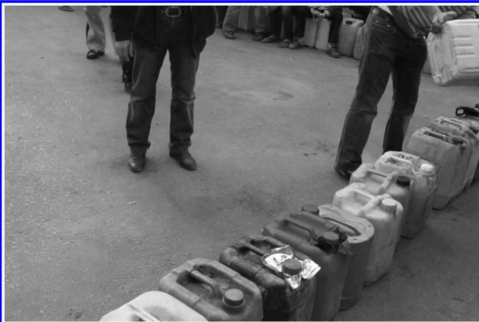
Palestinians wait in line to fill containers with emergency supplies of fuel provided by the International Committee of the Red Cross (ICRC) at a gas station in Gaza City, 2 April 2012.