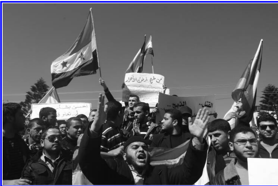
Palestinian protestors wave flags in solidarity with Syrian protestors during a demonstration against Syrian Pres. Bashar al-Asad in Gaza City, 21 February 2012.