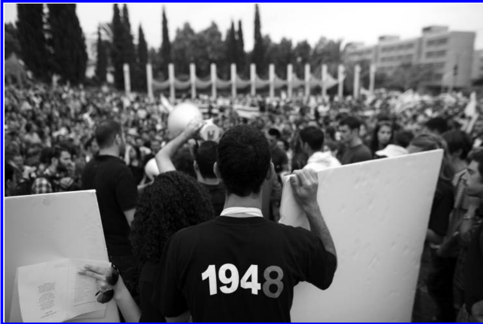
Jewish and Palestinian citizens of Israel participate in Nakba commemoration ceremonies in Tel Aviv, 14 May 2012.