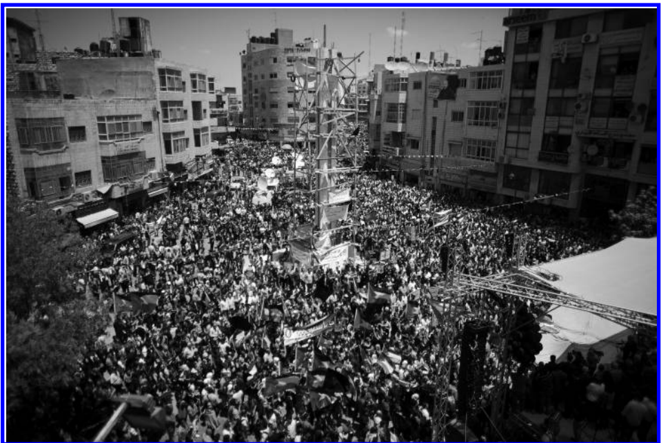
Palestinians gather in central Ramallah to mark Nakba Day commemorating Israel's expulsion of Palestinians in 1948, 15 May 2012.