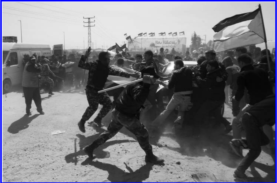
Hamas-affiliated police in Gaza prevent Palestinian demonstrators from marching to the Israeli border fence to commemorate Land Day, which protests Israel's ongoing confiscation of Palestinian land, Bayt Hanun, 30 March 2012.