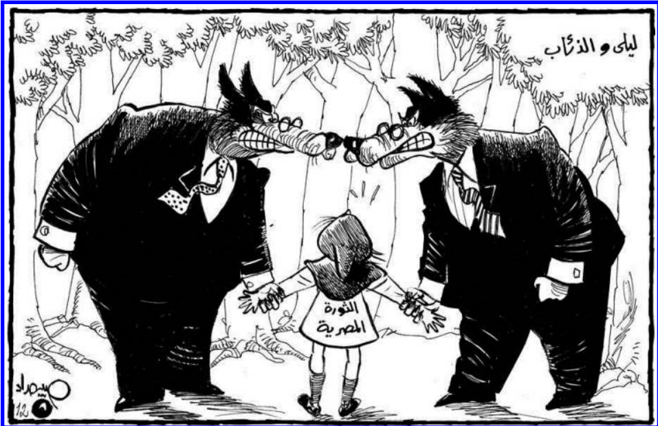
Red Riding Hood as the infant Egyptian revolution. (30 May 2012)