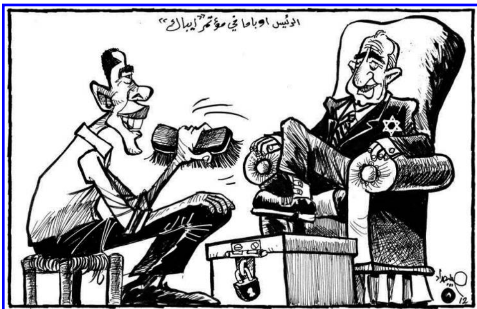
President Obama at the AIPAC conference in Washington, D.C. attended by Israel's president Shimon Peres. (6 March 2012)