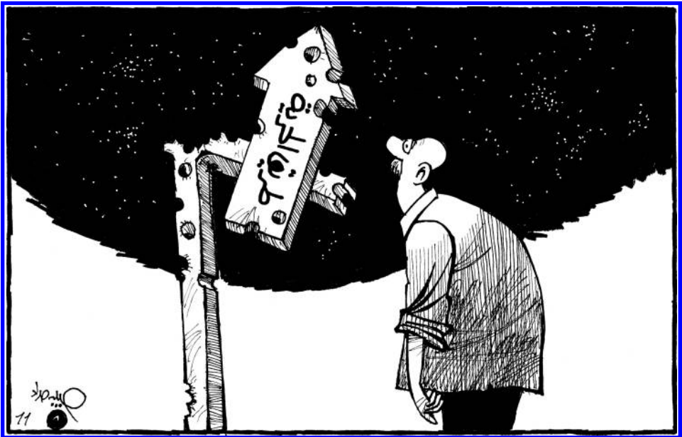
The signpost to democracy in the Arab world. (21 October 2011)