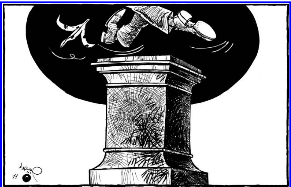
The precarious position of Arab rulers. (6 August 2011)