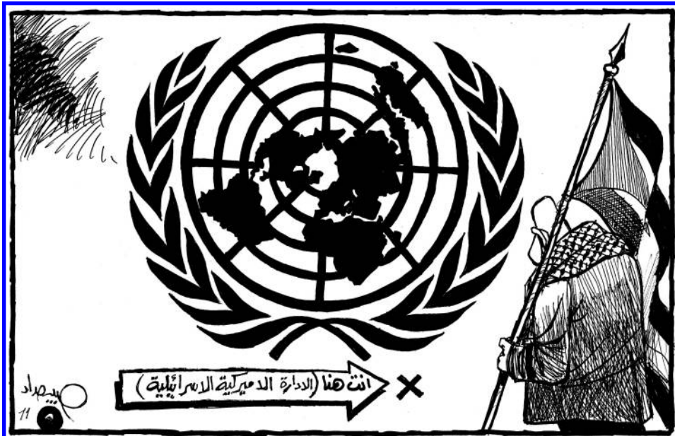
“The American-Israeli Administration” shows the position of Palestine at the UN. (27 May 2011)