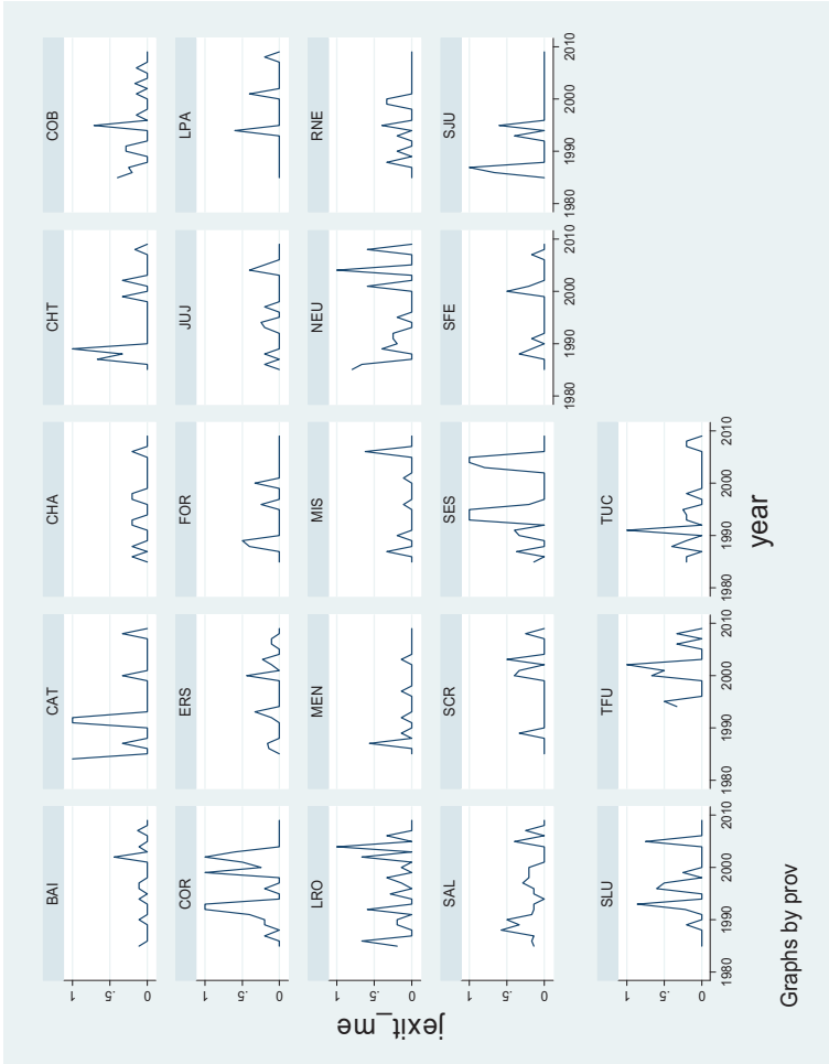
Figure 1: Reshuffles in the Provincial Supreme Courts, 1983–2009

Note: From 1983 to 2009 provincial supreme courts were reshuffled a total of 39 times. Santiago del Estero: 6 times; Corrientes and Neuquén: each 5 times; La Rioja: 4; Catamarca, San Juan, and San Luis: each 3 times; Chubut and Tierra del Fuego: each 2 times; Córdoba, La Pampa, Mendoza, Misiones, Salta, and Tucumán: each once. The Supreme Courts of Buenos Aires, Chaco, Entre Ríos, Formosa, Jujuy, Río Negro, Santa Cruz, and Santa Fe were not reshuffled during this period.