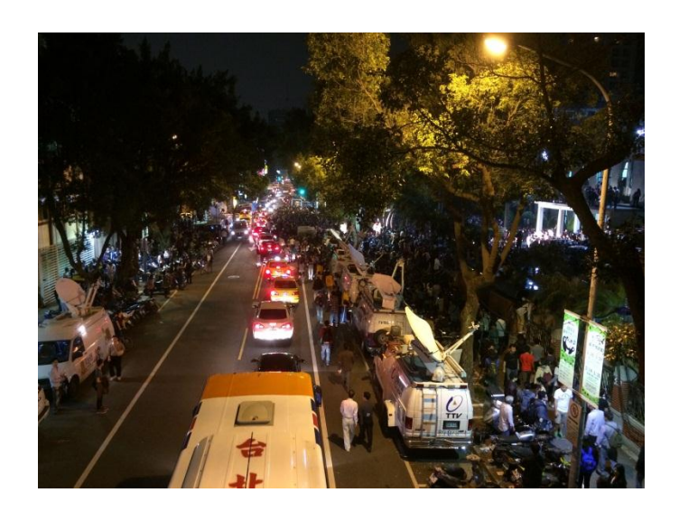
From the bridge over Qingdao East Road at night.