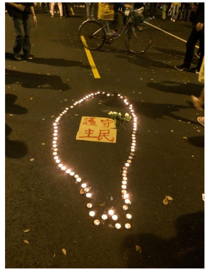
Candlelight vigil for Taiwan.

On Friday 21 March 2014 I watched from stairs of the pedestrian bridge over Qingdao East Road (access to the bridge itself was locked) in unabated amazement as