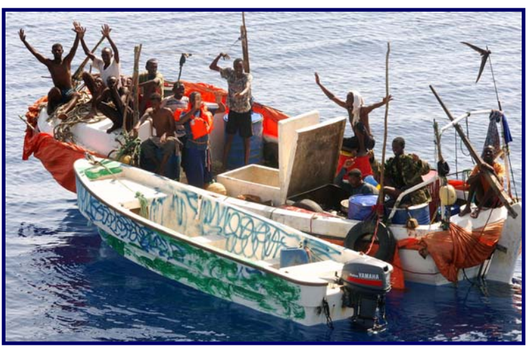
Suspected Somali Pirates

address the piracy problem within Somali territorial waters.<sup>10</sup> The actions of the French military in capturing some of the pirates in Somali territory suggested that bold action could eliminate the problem.