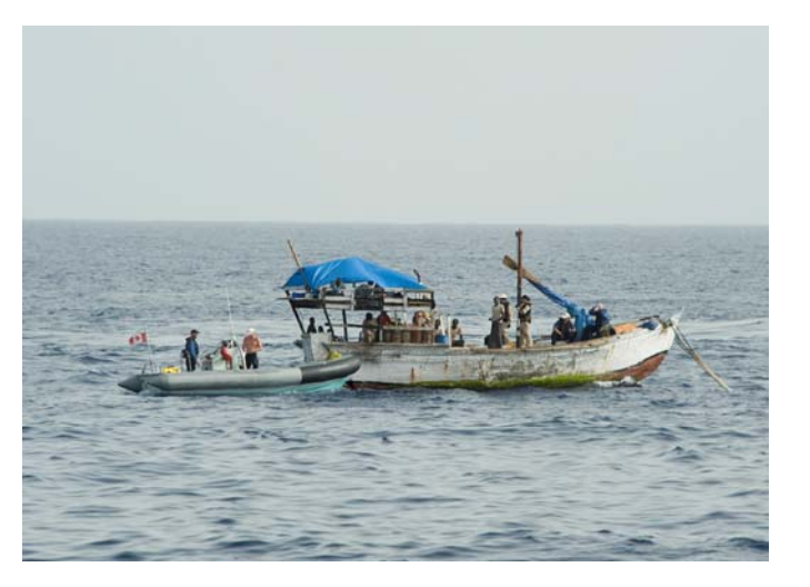
A SOLAS event involving the rescue of Somali

roughly 115 lives in the process. One of these involved a boatload of abandoned refugees, which had already lost six people. Tragic though it was, we were forced to take these people to the nearest port, Bossasso, in Puntland (Somalia).