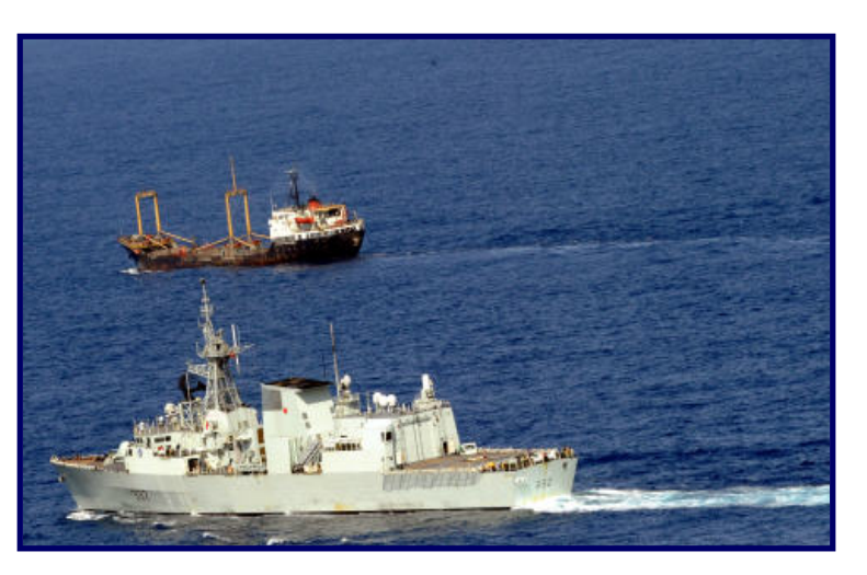
HMCS Ville de Québec escorts a WFP contracted vessel

crises. With significant ethnic populations from every part of the globe, the international character of the Canadian population will ensure that every crisis makes it to the front pages and news networks of the nation.