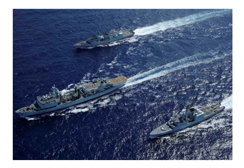
HMC Ships CALGARY, PROTECTEUR and IROQUOIS (top to bottom)

On 29 February 2008, the Minister of National Defence, the Hon. Peter MacKay, announced that Canada would lead Combined Task Force 150 (CTF 150), a naval coalition force operating in the Middle East. The Canadian contribution of three Canadian warships, HMC Ships Iroquois, Calgary and Protecteur , with embarked Flag-Officer level command staff, and supporting elements, collectively known as Task Force Arabian Sea, proceeded to the waters surrounding the Arabian Peninsula and the coasts of Pakistan and Somalia. The designated Task Force Commander, I had the honour to lead this fourth rotation of Operation Altair, Canada's ongoing maritime commitment to Operation Enduring Freedom.