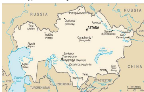
Figure1. Map of Kazakhstan

Among the Commonwealth of Independent States, Kazakhstan has the largest mines and natural resources (other than Russia). The country has very rich reserves of coal, oil and gas. Statistics in 1990 indicates that this country has provided 90% of chromium, 50% of coal, and 7% of the oil of the Soviet Union. Other important mineral resources of Kazakhstan are copper, zinc, silver, gold, manganese, lead, nickel, phosphate and uranium. Proven reserves of uranium in Kazakhstan are one million tons which is equivalent to 25 percent of global reserves (Yerzhan, 2009: 3). Also it is seventh in the world in terms of gold reserves. Kazakhstan is a producer and exporter of agricultural products. Grain has been important for Kazakhstan economy in the past and continues to be, and about half of the country's agricultural landscape is devoted to wheat cultivation.