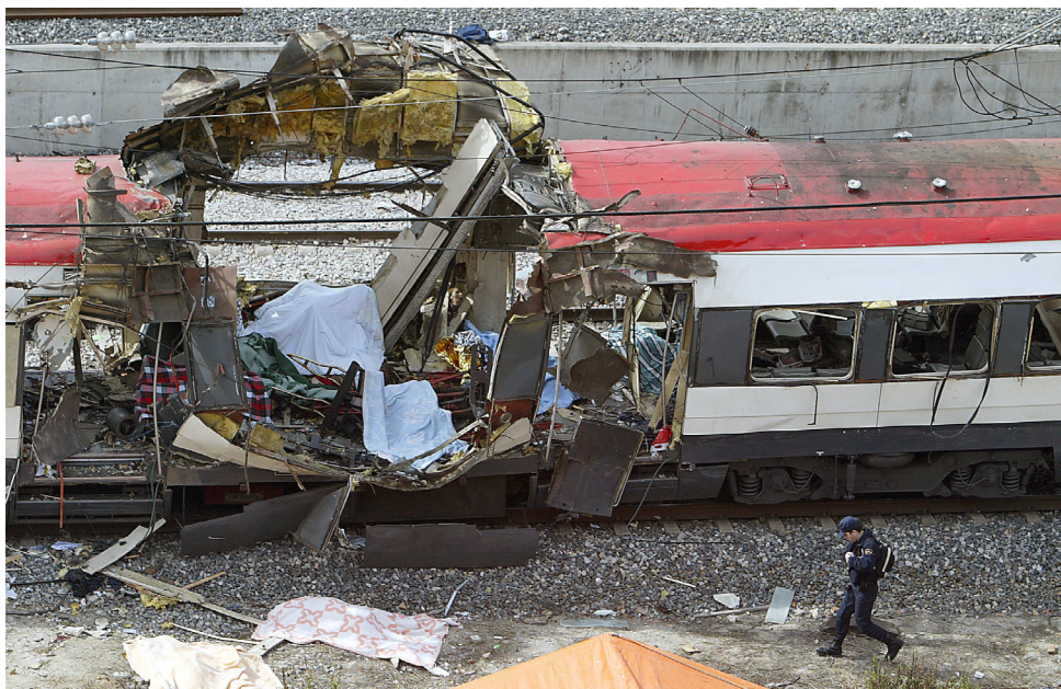
A policeman walks alongside a train that was bombed in Madrid on March 11, 2004.

ON MARCH 11, 2004, a series of coordinated bombings ripped through Madrid's commuter train system, killing 191 people. Although the attacks have been described as the product of an independent cell of self-radicalized individuals only inspired by al-Qa`ida, the extensive criminal proceedings on the Madrid bombings refute this hypothesis. 1 The network responsible for the Madrid attacks evolved from the remnants of an al-Qa`ida cell formed in Spain a decade earlier. It was initiated following instructions from an operative of the Libyan Islamic Fighting Group