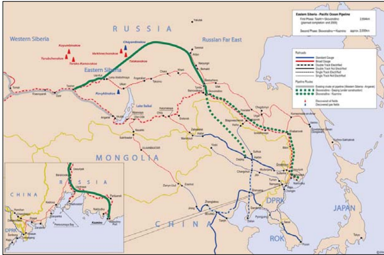
Figure 3: Eastern Siberia – Pacific Ocean Oil Pipeline (ESPO oil pipeline). 47

Regional Maritime Security Initiative (RMSI) and Five Powers Defense Arrangement (FPDA) with Malaysia, Singapore, Australia, New Zealand and United Kingdom. 48 ASEAN’s legitimacy in the eyes of the US and the Five Powers represents a factor of containment of piracy, but also demonstrates Western economic interests in the region. To a certain extent, these interests are mutual with those of China, but when the issue of Taiwan and the Spratley Islands is added to the mix, there are also factors of significant competition.