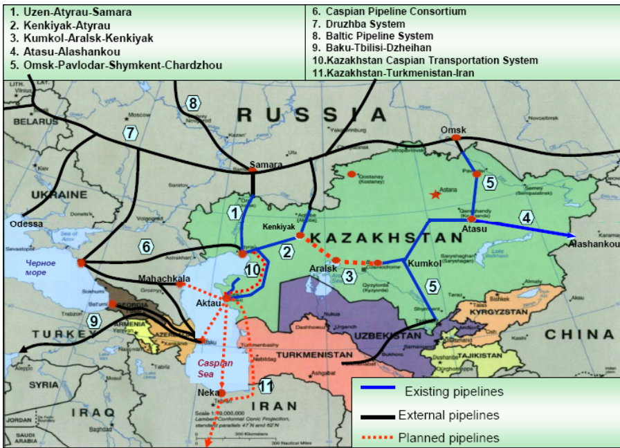
Figure 4: Oil Transportation Routes in Kazakhstan. 52

The Kazakhstan-China Crude Oil Pipeline joint project of CNPC and KazMunai-Gaz became operational in 2005; as a result Kazakhstan is providing oil to Xinjiang province with a capacity of 120000 bpd. Full capacity will be reached in 2011. Another joint pipeline is the Kenkiyak-Atyrau Pipeline being the first oil pipeline built in Kazakhstan since independence. CNPC has been cooperating with Kazakhstan companies from 1997, and “operates five oilfield development projects (CNPC AktobeMunaiGas, North Buzachi, PK, KAM and ADM), two exploration projects, the Kazakhstan-China Crude Oil Pipeline and the Northwest Crude Pipeline.” 51 It is important to notice that CNPC owns two thirds of the PetroKazakhstan. Hence, this cooperation is also important for Kazakhstan as it is decreasing reliance on Russia, and there is a direct link between provider and a reliable long-term customer.