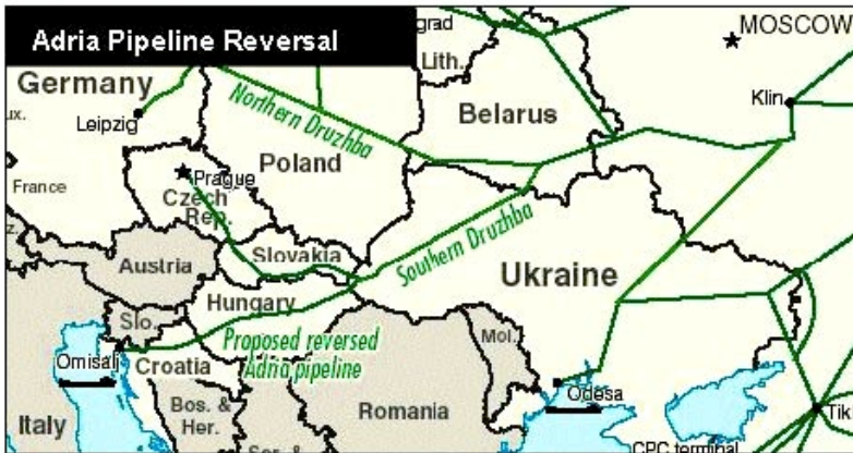
Figure 2: Druzhba and Adria Oil Pipelines 48

haven, Germany would reduce Baltic Sea tanker traffic and allow Russia to export oil to the United States via Germany.