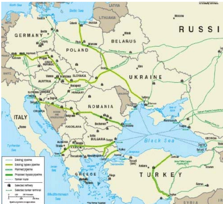
Figure 4: Proposed Bosphorus Bypass Options 51

The increasingly large Chinese demand for oil has led to serious consideration of building a pipeline from the Russian city of Taishet (northwest of Angarsk) to Nakhodka (near the Sea of Japan) or to Daqing, China (see Figure 5). Both routes pass close to Lake Baikal, a site that presents environment-related obstacles. The Nakhodka route, which is longer, would provide a new Pacific port from which Russian oil could be shipped by tanker to Japan and other Asian markets and possibly to North America. Japan has offered USD 5 billion to finance construction and USD 2 billion for oil field