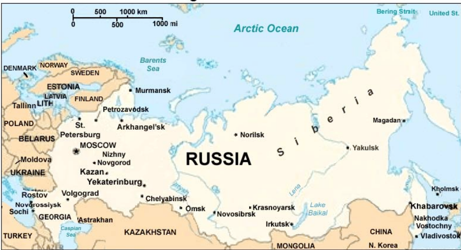
Figure 1: Russia 5

well have contributed in this regard. Russian crude oil production reached 9.0 million bbl/d in 2005 and rose slowly in 2006 to 9.2 million bbl/d. 6