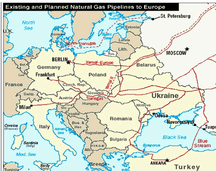
Figure 6: Natural Gas Pipelines to Europe 59

A North Trans-Gas pipeline, or North European Gas Pipeline (NEGP), extending over two thousand miles from Russia through the Gulf of Finland to Denmark—and, ultimately, to the United Kingdom, via the Baltic and North Seas—was proposed in June 2003 by Russia and the United Kingdom. 57 Gazprom and Germany's BASF and E.ON agreed on 8 September 2005 to set up a joint venture to build the pipeline. Originating in the St. Petersburg region, a 700-mile segment of the pipeline is to pass under the Baltic Sea. The first leg of the pipeline, which is under construction, is scheduled to come on stream in 2010. 58 This new pipeline route will benefit Russia, since it