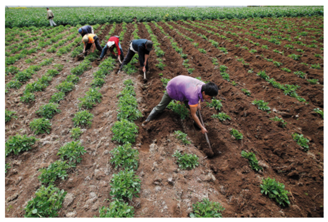
Will these crops find a lucrative market post-peace?