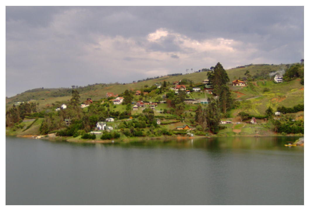
Lago Calima in the northwestern state Cauca in Colombia.