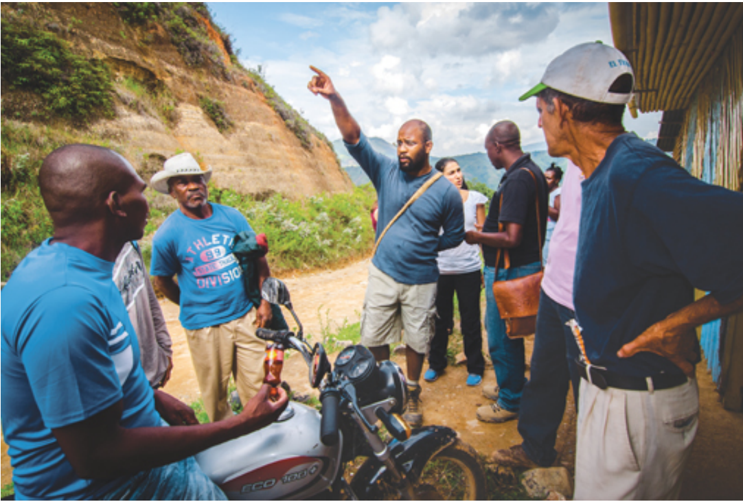
La Toma residents gather around the joint community center/discoteca high in the hills of the province of cauca.