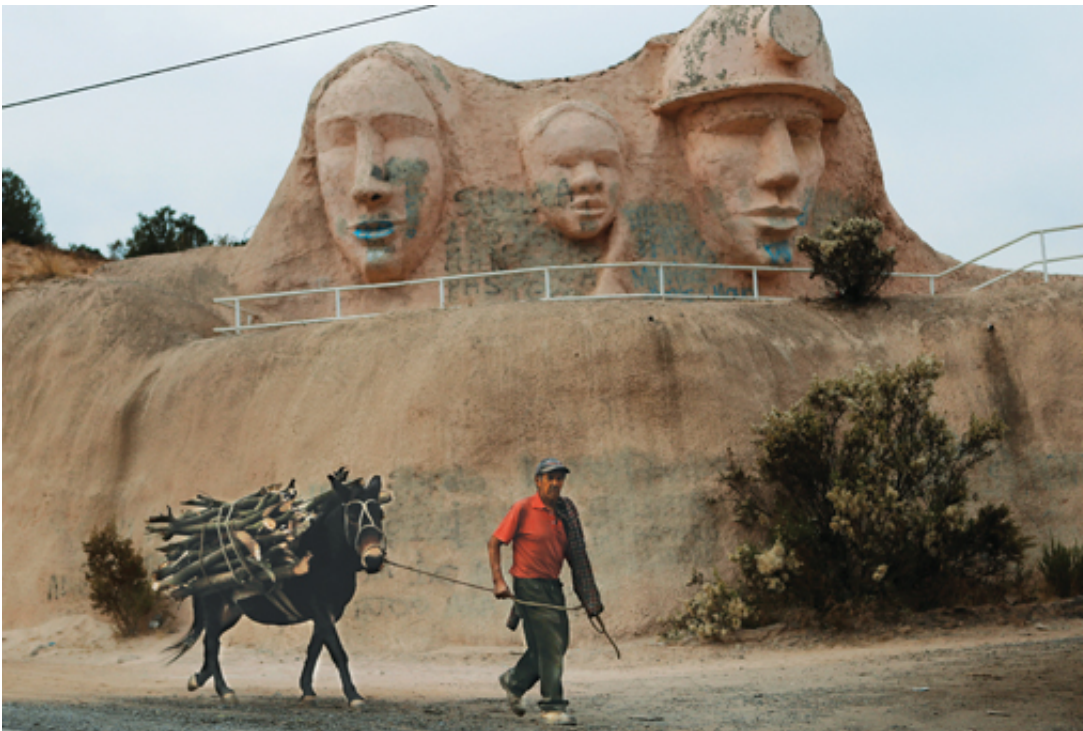
A Miner Mount Rushmore: A man leads his mule past a monument to miners on the way to El Teniente copper mine.