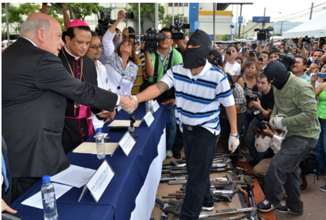
Gang members in El Salvador voluntary give up their weapons to Monsignor Colindres and OAS officials.