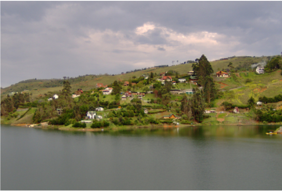
Lago Calima in the northwestern state Cauca in Colombia.