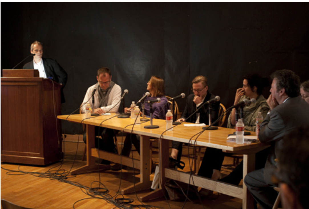
A discussion of Latin American architecture at the University of Texas-Austin.

Two such challenges stand out. The first is the rise of global studies, both as an area of teaching and as a force of institutional reorganization (e.g., global studies institutes that displace traditional area studies centers). The global studies approach is a call for conceptual innovation, based on the view that scholars bound to a particular region are ill-prepared to grasp increasingly globalized processes of historical change, and that these processes are changing the way we study and learn, leaving area studies behind. The second, closely related challenge is the monumental shift from book to byte, which has called into question the structure and function of libraries, and transformed priorities for the acquisition of global scholarly resources.