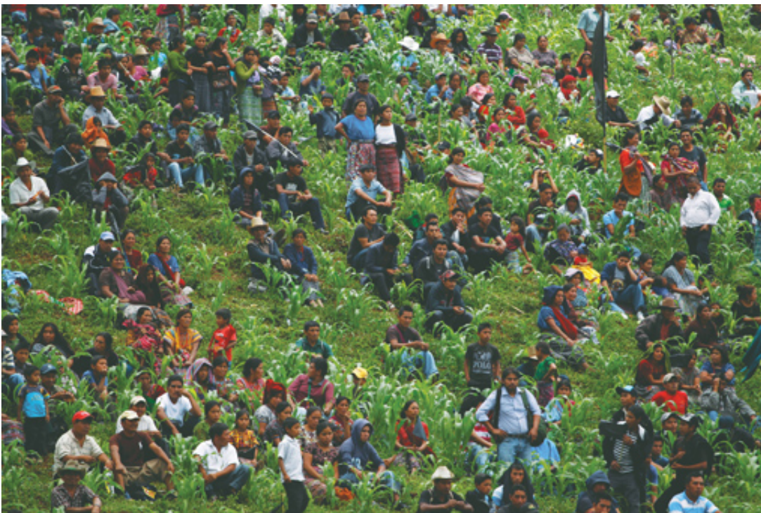
A protest in San Juan Sacatepéquez in July 2013.

The overthrow of President Jacobo Árbenz in 1954 unleashed over three decades of violence that directly affected and often targeted Indigenous peoples. According to data from the Comisión para el Esclarecimiento Histórico (Commission for Historical Clarification—CEH) and the Proyecto Interdiocesano de Recuperación de la Memoria Histórica (Inter-Diocesan Recovery of Historical Memory Project—REMHI), more than 1 million people were displaced, hundreds of communities destroyed, and more than 250,000 people killed or “disappeared” during the armed conflict. Other victims include 80,000 widowed women, 200,000 orphans, 700,000 people conscripted by paramilitary groups such as the Patrullas de Autodefensa Civil (Civil Self-Defense Patrols), and more than 50,000 identified and 25,000 unidentified refugees.