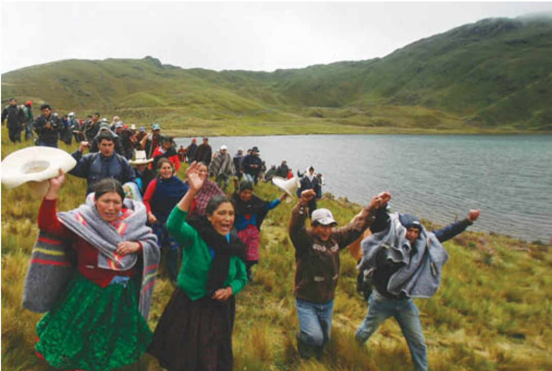
Hear us roar: Protest against Newmont Mining Corporation's Conga project in the Cajamarca region on June 17, 2013.