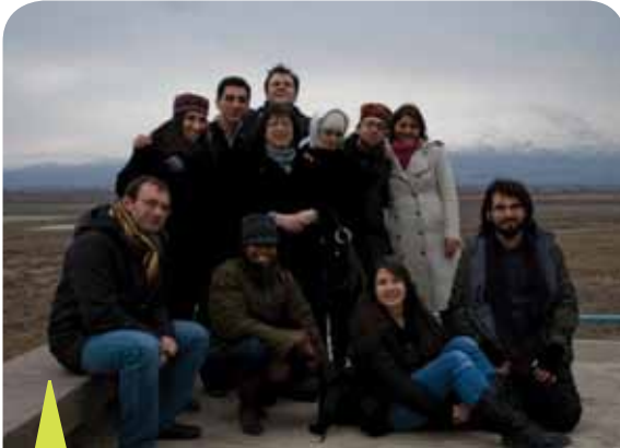
The Turkish and Armenian participants with Internews staff visit Khor Virap, a monastery near the Turkish border in Armenia.

“The Documentary Filmmaking activity positively contributed to the Dialogue-Building Project, and it showed once again that the problem between Turkey and Armenia is only political.”