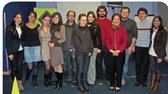
The Turkish and Armenian participants of the Youth Exchange meet with US Ambassador to Armenia Marie L. Yovanavitch in February 2011 at the Internews Armenia offices

differences between the two countries created challenges for the students, they also helped the participants understand the neighboring country from a deeper perspective.