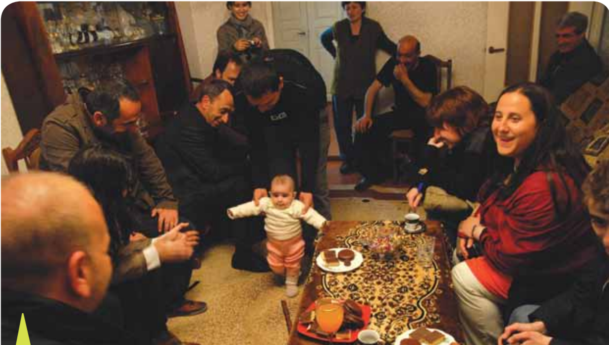
An Armenian family living in a shelter in Gyumri hosts the bus tour group in their home.