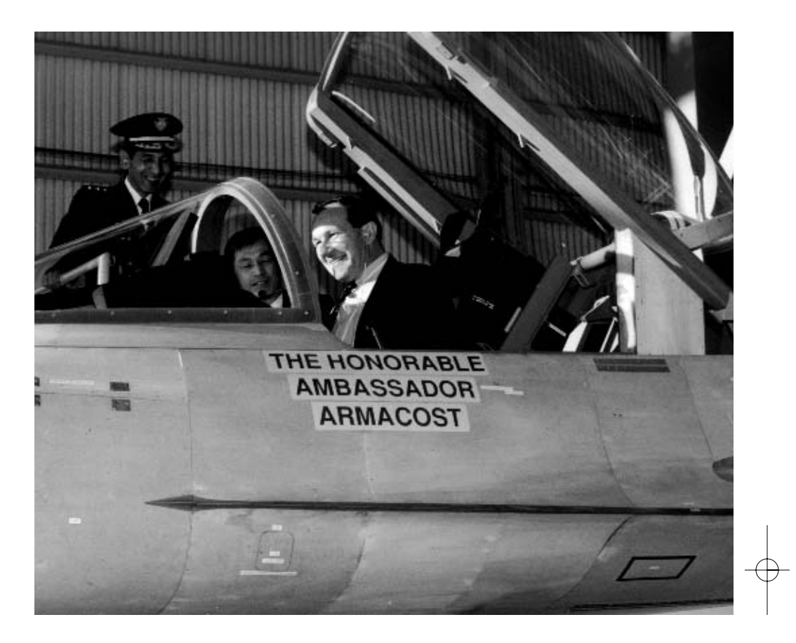
NOVEMBER 1992 Checking out a mock-up of the jointly developed FSX fighter plane in Nagoya.