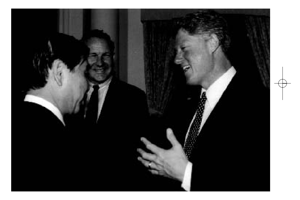
JULY 1993 President Clinton meets future prime minister Tsutomu Hata at a reception at the U.S. ambassador's residence.

Armacost Photoessay 3/24/04 3:10 PM Page 11