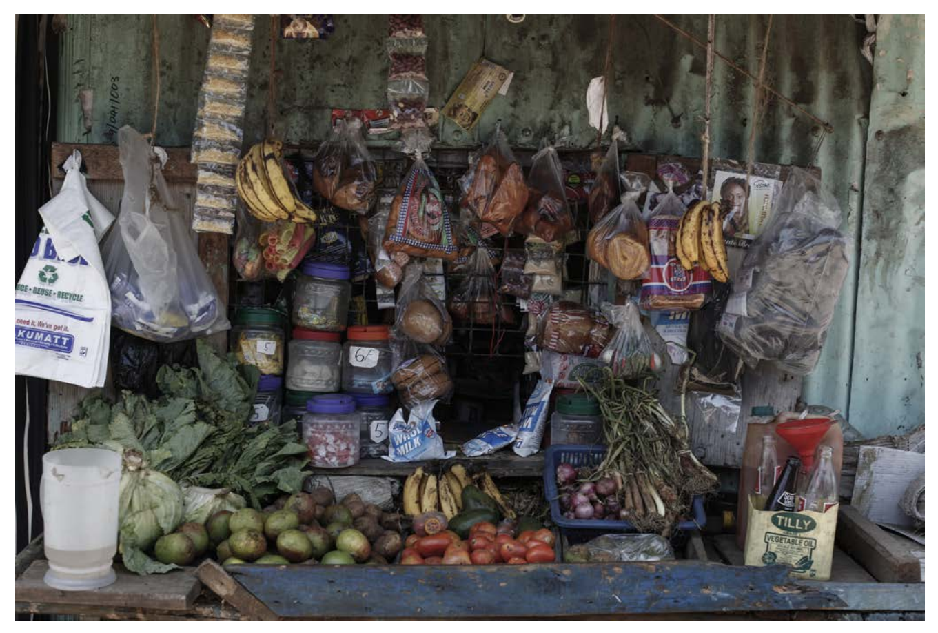
Local food store, Mukuru informal settlement, Nairobi 2014.